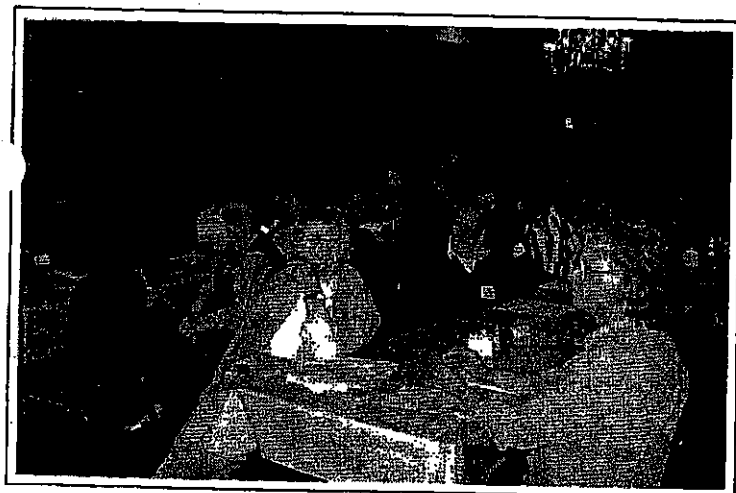
Newly Elected Officers for Year 2000 - 2001