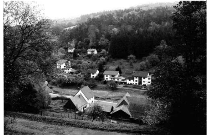
Hebstahl, a "Strassendorf" (One-Street Village) in the Odenwald.