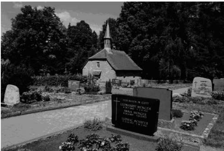
The Sensbachtal cemetery and the "Friedhofskapelle" (Cemetery Chapel) in the background.